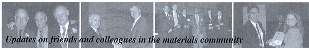
Updates on friends and colleagues in the materials community