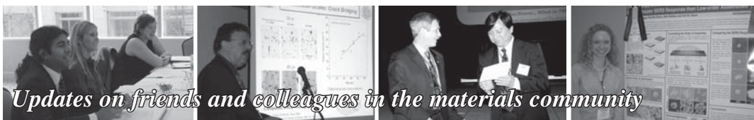
Updates on friends and colleagues in the materials community