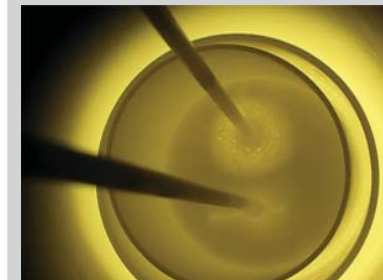
Allanore's and Yurko's experimental electrolysis cell at 1,600°C, with oxygen bubbles escaping from the anode (upper rod) through the molten oxide electrolyte. The other rod is the cathode on which the molten metal is produced.

"It didn't take long for me to realize that Antoine was a very talented re-